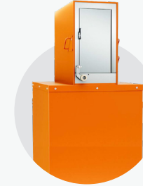
Vaults and other garage equipment

Genfare Link is supported on all Genfare smart fareboxes* and ticket vending machines,** but compatibility doesn't end with Genfare. All smart fare collection equipment and platforms, regardless of supplier, can connect with Genfare Link, such as: