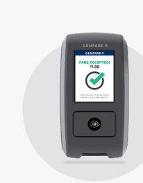
Freestanding and handheld validators