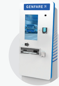
Ticket vending machines