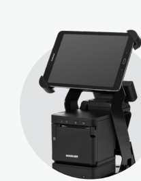
Point of sale terminals